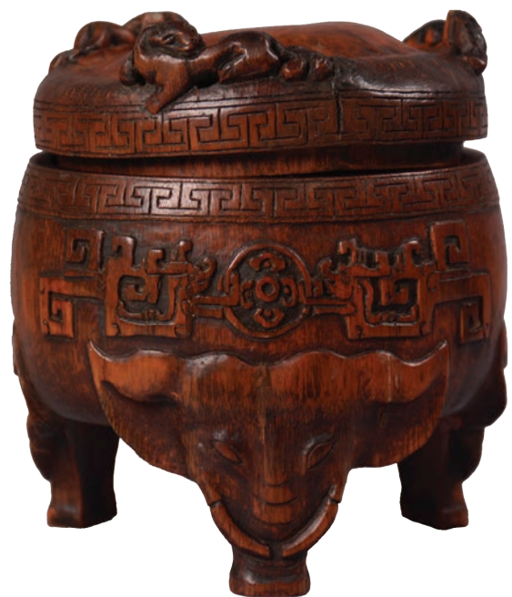
Water pot with lid, Kangxi period, Qing Dynasty, China. Fred A. Freund Collection, 2016.14.0004.

Free admission. Check the Museum's calendar of events for individual film confirmations and aems.illinois.edu for descriptions and trailers.