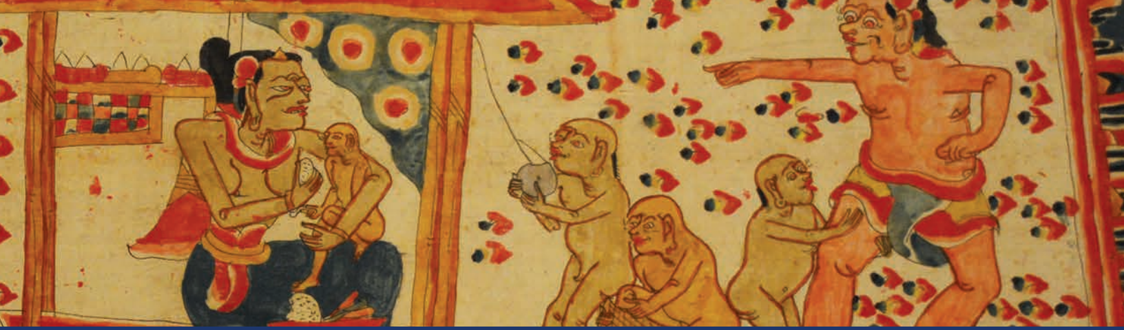
Ider ider, temple painting. Bali, early 20th c. 2016.04.0001.