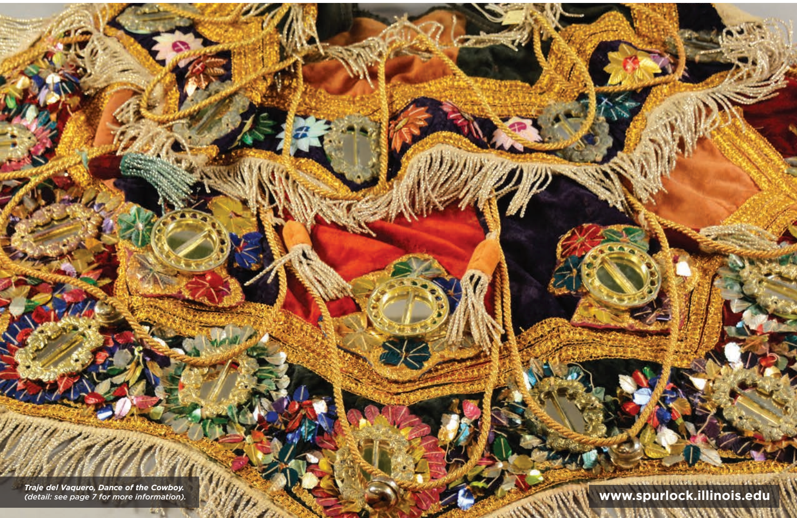
Traje del Vaquero, Dance of the Cowboy. (detail: see page 7 for more information).

College of Liberal Arts & Sciences AT ILLINOIS