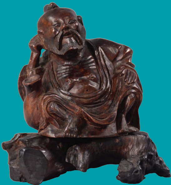
Li Bai on base, Qing Dynasty, China.