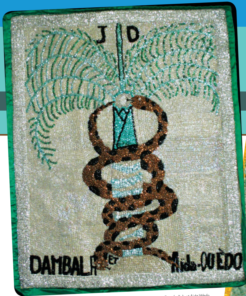
Damballah et Aida Wedo.

Join us on Thursday, April 10, at 7 p.m. for the opening reception of Sacred Symbols in Sequins , including a performance of Haitian dance. ♦