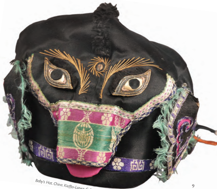
Baby's Hat. China. Kieffer-Lopez Collection, 2013.04.0032.

Free admission. All screenings begin at 7 p.m. Check the Museum's calendar of events for individual film confirmations and www.aems.uiuc.edu for descriptions and trailers. Spring 2014 AsiaLENS programming is co-sponsored by Center for East Asian and Pacific Studies, Asian American Cultural Center, East Asian Languages and Cultures, School of Literatures, Cultures, and Linguistics, Media and Cinema Studies, and Department of English.