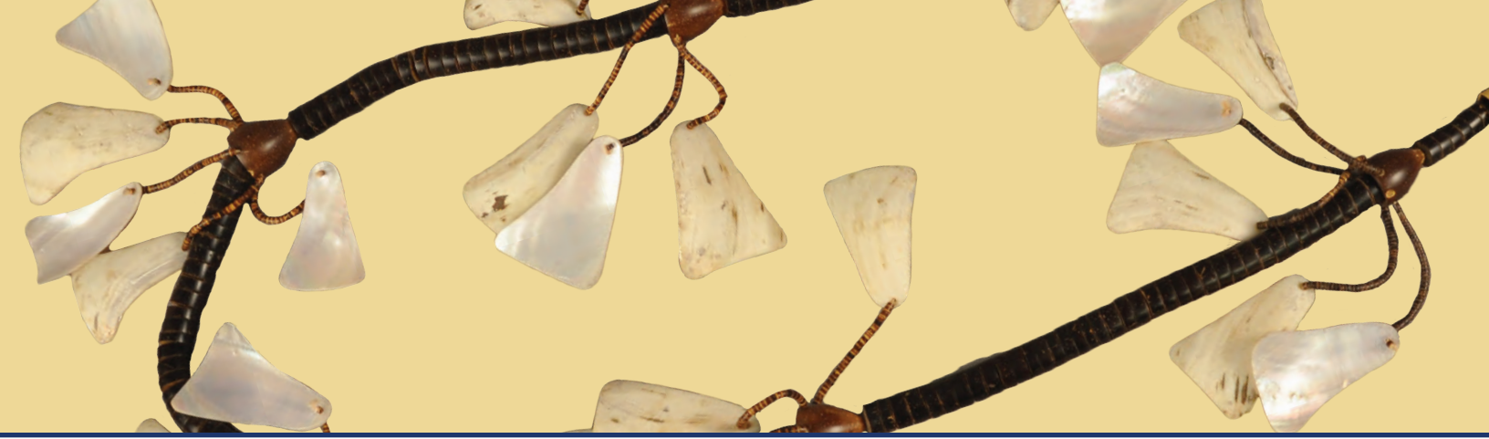
Ceremonial Bandolier Belt. Brazil. Kieffer-Lopez Collection, T05681.