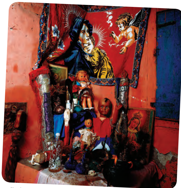
Altar for Ezili.