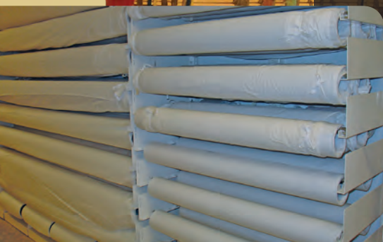
Rolled textiles neatly and conveniently arranged in new storage.

The Museum regularly receives donations of wonderful artifacts, but it's much more unusual to receive gifts for storing them. In August of 2013, we were lucky to receive such a donation by Plymouth Tube Company. They donated over 480 feet of stainless steel tubing cut to several different custom lengths. Brian Meek, general manager of Plymouth's facility in East Troy, Wisc., commented, "When we have the opportunity to aid in the community, we like to step forward and make a strong contribution. [Working with] the Spurlock Museum is a unique opportunity for us to provide product we manufacture to help preserve history." The Museum is a different client than Plymouth's typical customers in transportation, energy, and aerospace.